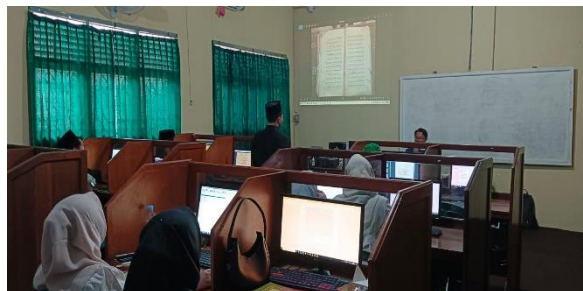
Figure 3. Arabic-Latin Transliteration Practice

Transliteration practice represented a significant technical challenge. Initial difficulties arose from inaccurate application of the Standard Transliteration Guidelines (SKB Three Ministers), particularly regarding long vowels (ā, ī, ū) and characteristic Arabic consonants (gh, kh, sy, dz). However, through repeated practice, 90% of participants successfully internalized the transliteration standards. The most notable development was participants' ability to address Pegon orthography challenges---the ambiguous vowel writing in Nusantara Arabic script---and accurately translate handwritten script into consistent Latin text.