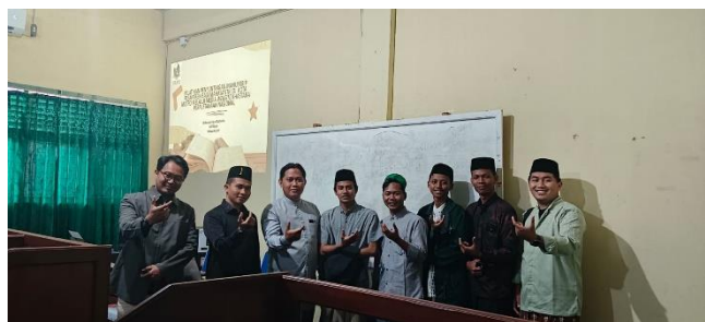
Figure 2. Manuscript Description Exercise

Following manuscript selection, participants engaged in codicological description practice. Initially, participants tended to record only surface-level information (titles, page counts) and struggled to identify colophons or scholia in digital images. Through structured guidance, 85% of participants demonstrated significantly improved observational skills, systematically documenting manuscript details including script type, estimated dimensions, and physical condition.